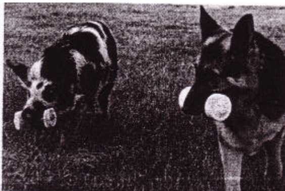
Agility wizard Purdey with a German Shepherd friend.

SPECTATORS at an agility display were astonished to see the team's new recruit – a heavyweight pig.