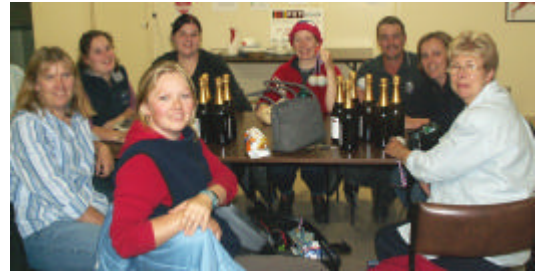
The winning table

Once again the trialing community got behind the VCA Agility Committee's Trivia Night to raise funds to purchase uniforms for our Victorian Team for the 2005 National Teams Event. Ten tables participated and raised a total of $1,169.85 which was straight profit.