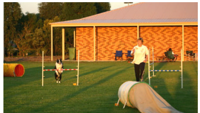
Roslyn had two very successful evenings

Thank you everyone who entered our first two trials. Many people worked hard to make them a success and we really appreciate their input.